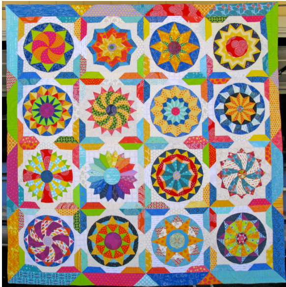
Block Five: Capella