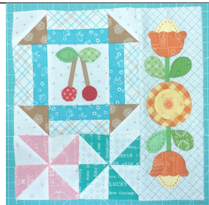
BLOCK SEWN WITH OTHERS